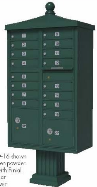
Model 1570-16 shown in forest green powder coat finish with Finial Cap and Pillar Pedestal Cover