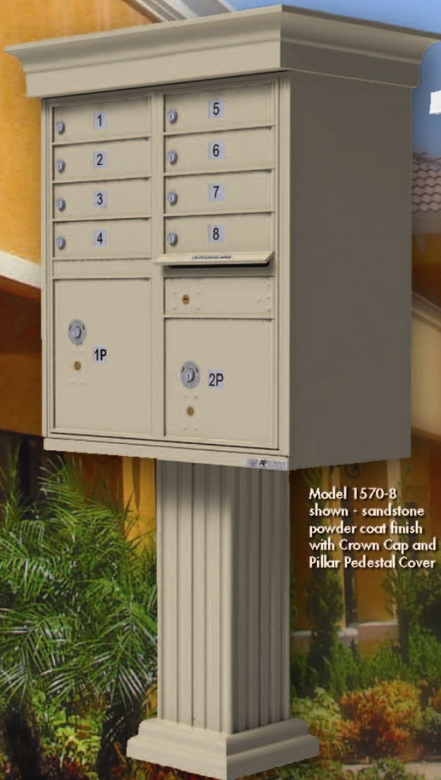
Model 1570-8 shown - sandstone powder coat finish with Crown Cap and Pillar Pedestal Cover