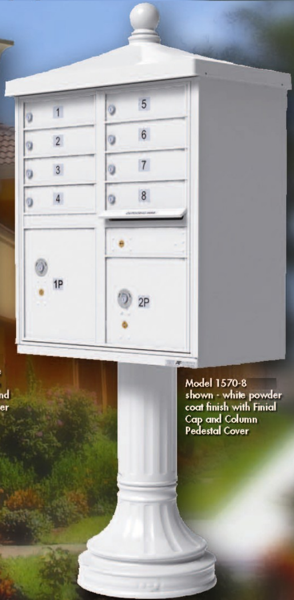
Model 1570-8 shown - white powder coat finish with Finial Cap and Column Pedestal Cover