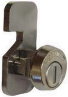
5-pin lock with "hook" cam

A USPS approved 5-pin tumbler lock with a 7 gauge stainless steel "hook" cam on a single-layer 14 gauge steel door