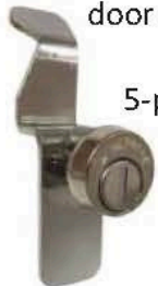
5-pin lock with SS cam

A USPS approved 5-pin tumbler lock with 10 gauge stainless steel cam. This lock includes the 10 gauge stainless steel Claw Locking Mechanism with a door made of two 14 gauge steel plates pressed together.