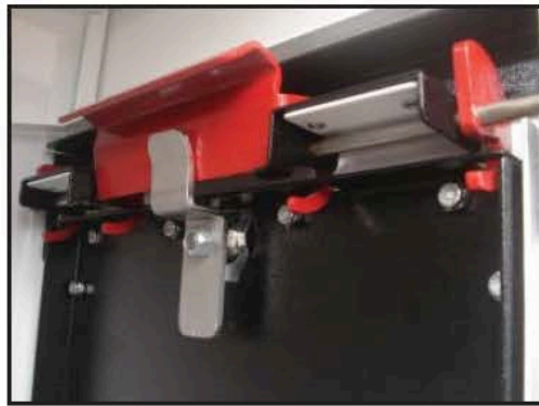
Cam, door and the Claw Locking Mechanism engaged on box.