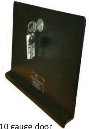
10 gauge door