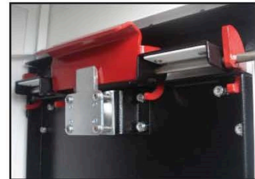
Deadbolt, door and the Claw Locking Mechanism engaged on box.