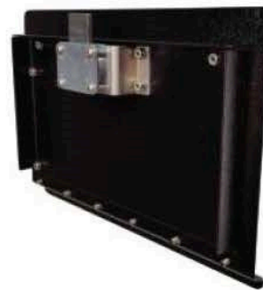
Two 14 gauge plated door