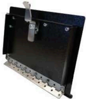
Two 14 gauge plated door