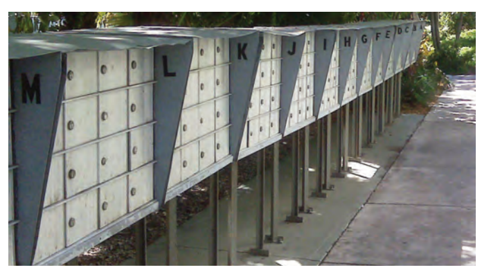
Obsolete NDCBUs are no longer permitted for replacement or new installations.