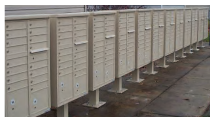
New CBUs accommodate both mail and packages while providing greater security.